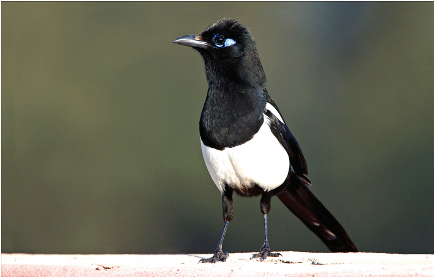
Magpie of race mauretanica