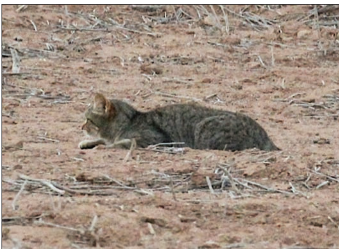
African Wildcat by Simon Wood