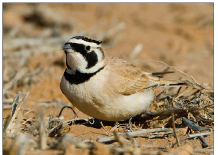
Temminck's Lark