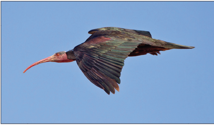
Bald Ibis by Tony Coombs

The views of the Ibis were fantastic and thoroughly enjoyed by everyone. A couple of GREAT SPOTTED CUCKOOS perched in a scrubby bush but promptly disappeared and were not relocated. A male SPECTACLED WARBLER kept low down in the coastal scrub before flying down towards the cliff. A real shock was a QUAIL flying past us which again disappeared in the dense cover. With our stomachs rumbling we drove to Tamri for lunch and from the restaurant balcony found our first SPANISH SPARROWS and LAUGHING DOVES.