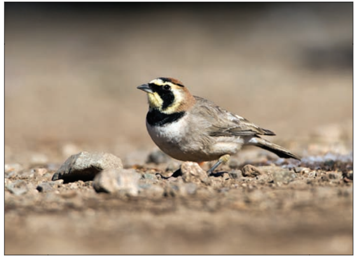
Atlas Shore Lark