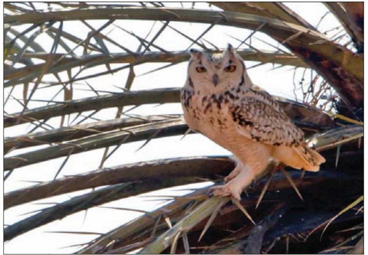
Pharaoh Eagle Owl by Tony Coombs

After a slightly more leisurely breakfast we left the hotel at 8.00am and drove east of Goulemine. A stop in suitable habitat produced three WHITE-CROWNED BLACK WHEATEARS which showed rather well around the settlement. A couple of THICK-BILLED LARKS flew over but were elusive on the ground, although rather more obliging were four TEMMINCK'S LARKS that ran around in front of us. Raptors were thin on the ground with only LONG-LEGGED BUZZARD and a couple of KESTRELS to show for our efforts. Some BLACK-BELLIED SANDGROUSE flew over and gave great underwing views.