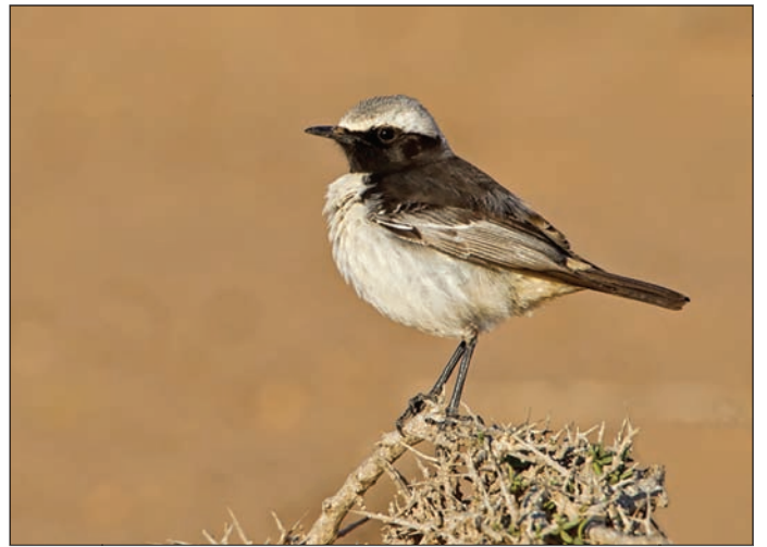
Red-rumped Wheatear by Tony Coombs