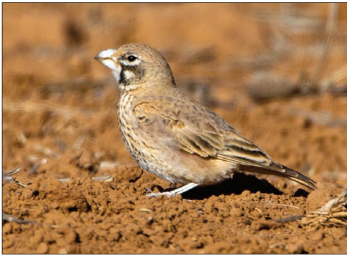
Thick-billed Lark