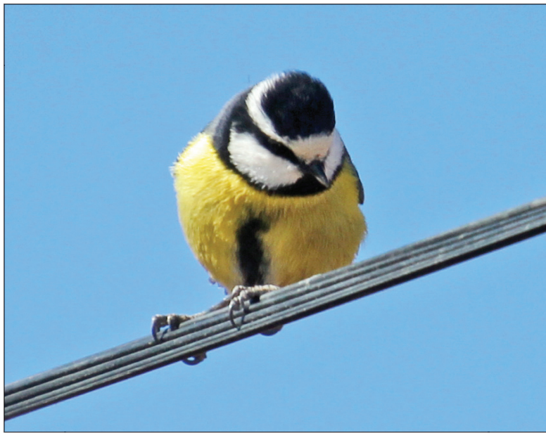
African Blue Tit