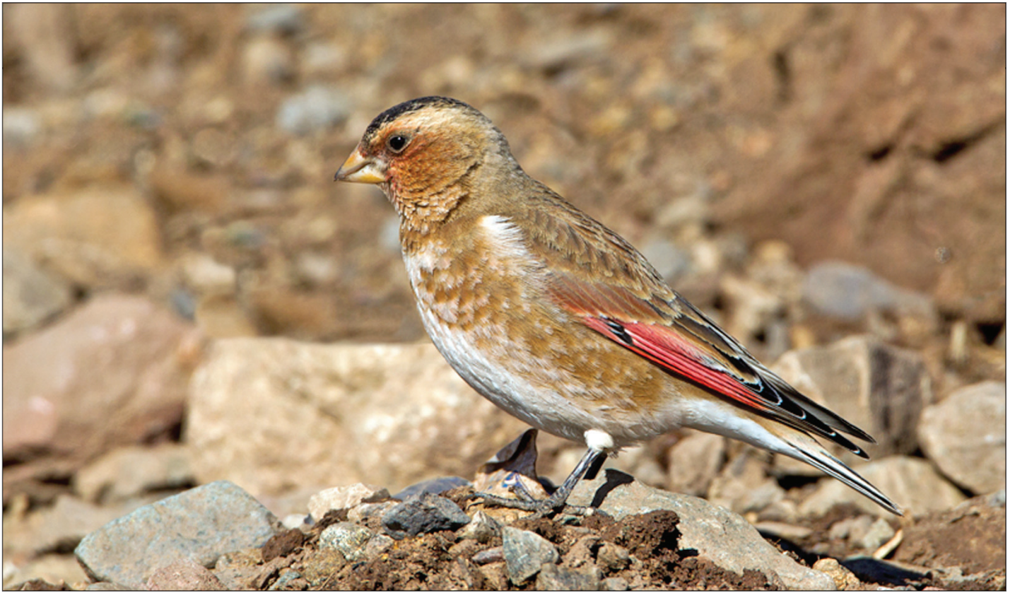
Crimson-winged Finch by Tony Coombs

Afterwards, we strolled down through the village but the place was heaving with visitors enjoying a bank holiday so Josele planned another stop down the valley hoping it would be quieter. Pulling off the road we watched a pair of MISTLE THRUSH close by and then a stunning male MOUSSIER'S REDSTART. On the opposite side of the road a female BLACK WHEATEAR showed well and with a little encouragement from the Mp3 player, the male came in to defend its territory. The rest of the walk yielded BLACK REDSTART, CHIFFCHAFF, SARDINIAN WARBLER, BLACKCAP and plenty of RED-BILLED CHOUGHs.