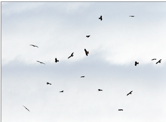
Black Kites