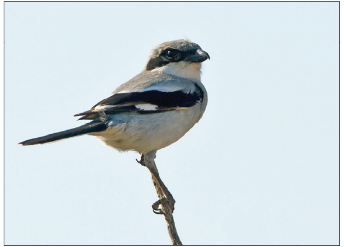
Southern Grey Shrike by Tony Coombs