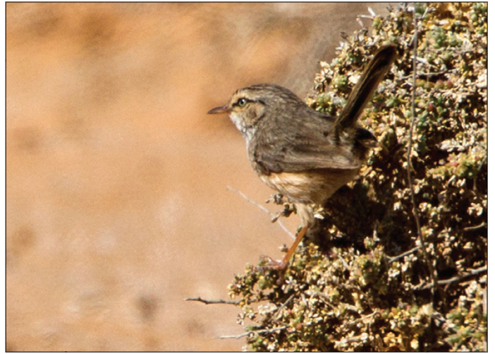
Scrub Warbler by Tony Coombs