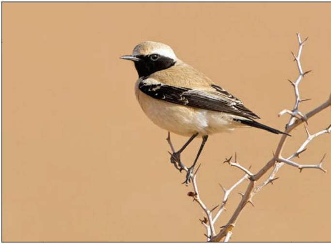
Desert Wheatear by Tony Coombs